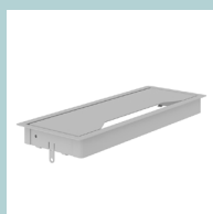
Metal grommet: 317x119 mm, H=27 mm